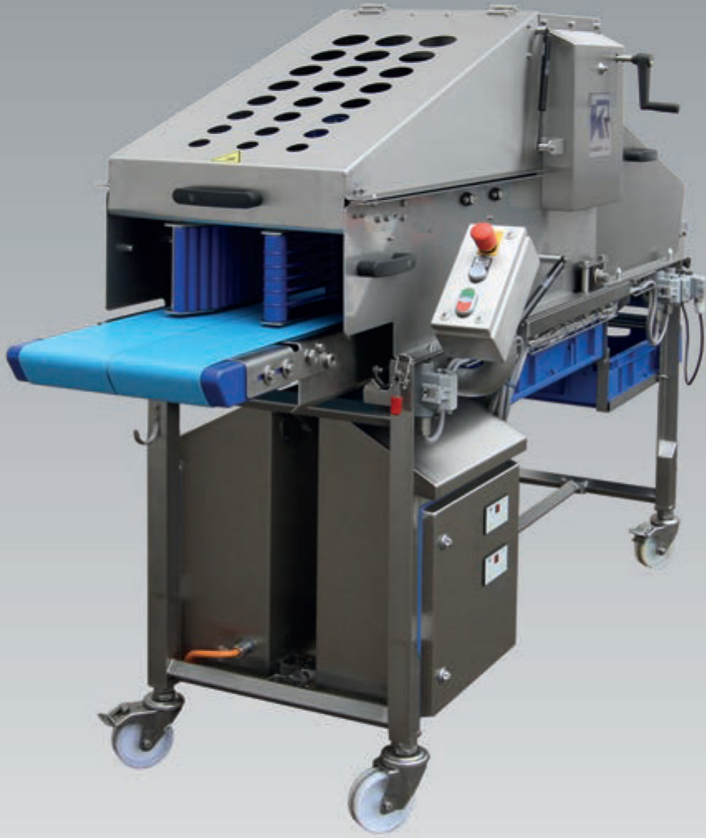
» enter side «