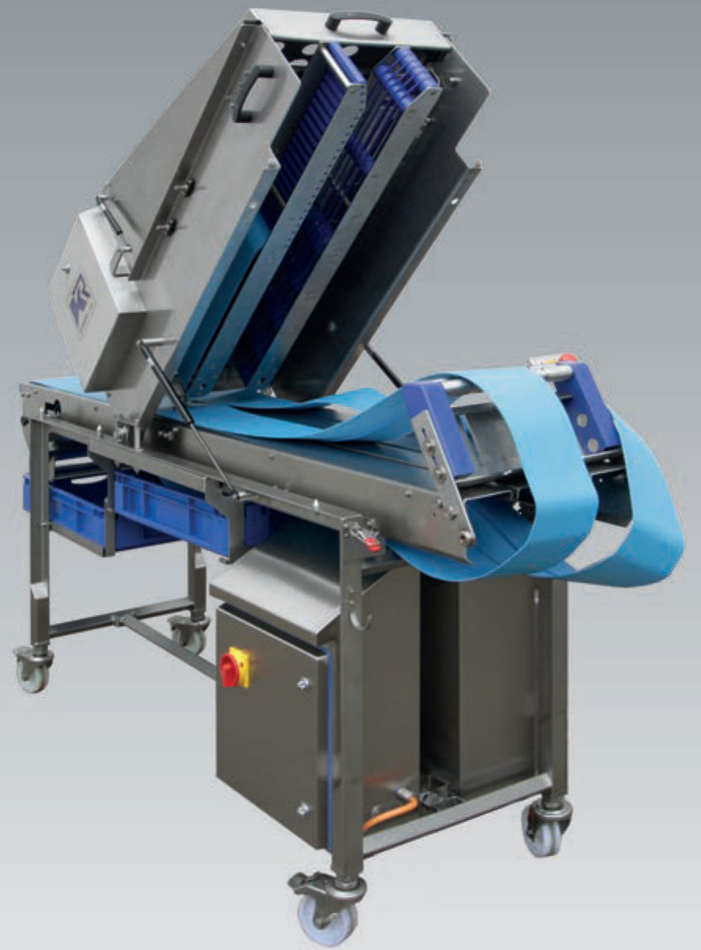
» cleaning position «