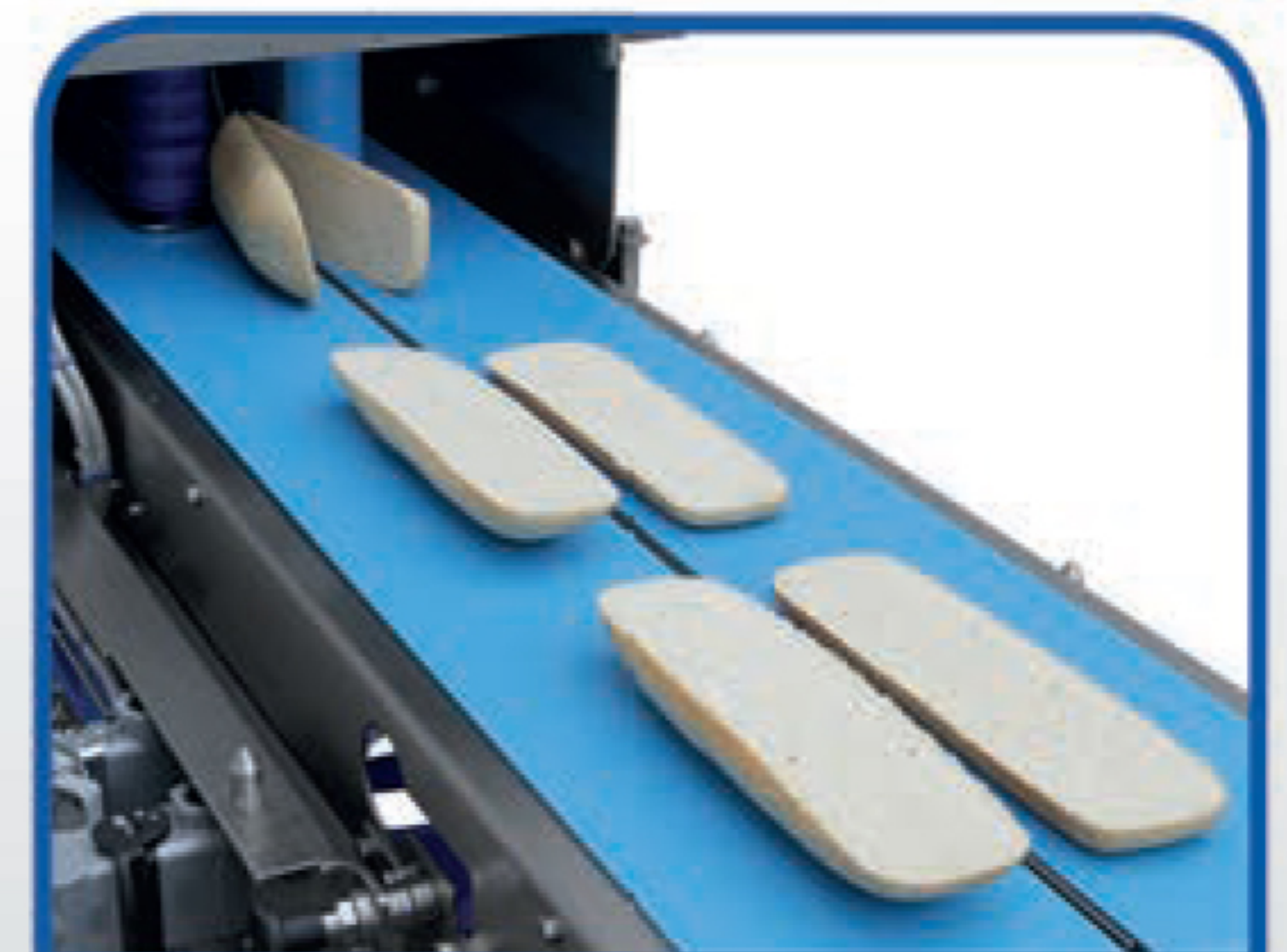
cutting-through with cutting surface up