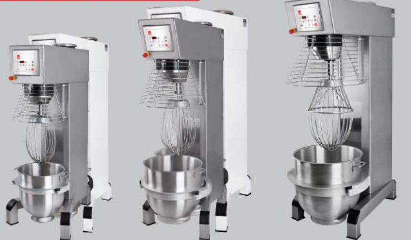
ERGO BEAR 60 Qt. ERGO BEAR 100 Qt. ERGO BEAR 150 Qt.